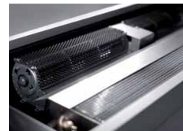
Outlook of Inner Installation

The convector tank is made of galvanized steel coated with epoxy-polyester spray layer. The framed Al-natur roll grill covers the convector/floor transition. Each convector is equipped with a ZVD001 regulator to control fan engine speeds under the 230V AC voltage. 2 convector types with tangential fans and 3 fanless types are available, both in the lengths of 1200, 1600, 2000, 2200, 2800 mm and height of 115 mm. No dimension modifications or atypical grills and convector shapes are available. Articles for spot delivery.