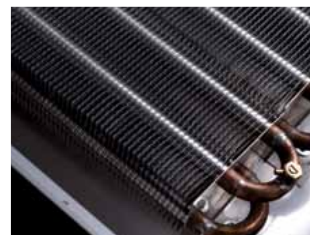
Al/Cu- Lamellar Exchanger

A wide assortment of convectors, operating voltage of 230V AC . Suitable for industrial structures and specific projects due to the extensive variability. New offer: Models with continuous speed control under the operating voltage of 24V DC (power saving fans, continuous speed regulation, 24V DC safe voltage, control in the range of 0-10V, Al/Cu heating exchanger, integration to BMS-System). A new generation of modern convectors.