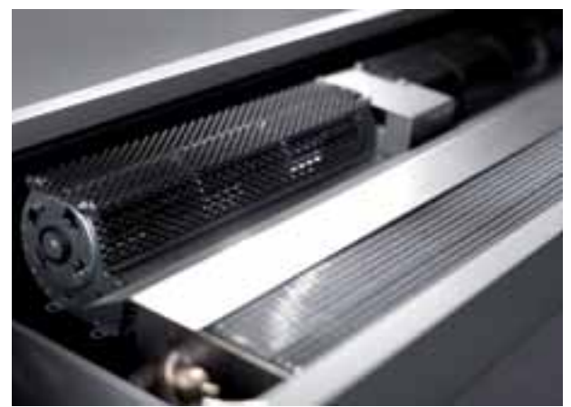
Outlook of Inner Installation

The convector tank is made of galvanized steel coated with epoxy-polyester spray layer. The framed Al-natur roll grill covers the convector/floor transition. Each convector is equipped with a Z-VD001 regulator to control fan engine speeds under the 230V AC voltage. 2 convector types with tangential fans and 3 fanless types are available, both in the lengths of 1200, 1600, 2000, 2200, 2800 mm and height of 115 mm. No dimension modifications or atypical grills and convector shapes are available. Articles for spot delivery.