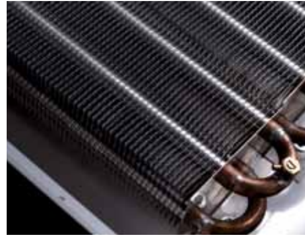
Al/Cu- Lamellar Exchanger

A wide assortment of convectors, operating voltage of 230V AC. Suitable for industrial structures and specific projects due to the extensive variability. New offer: Models with continuous speed control under the operating voltage of 24V DC (power saving fans, continuous speed regulation, 24V DC safe voltage, control in the range of 0-10V, Al/Cu heating exchanger, integration to BMS- System). A new generation of modern convectors.